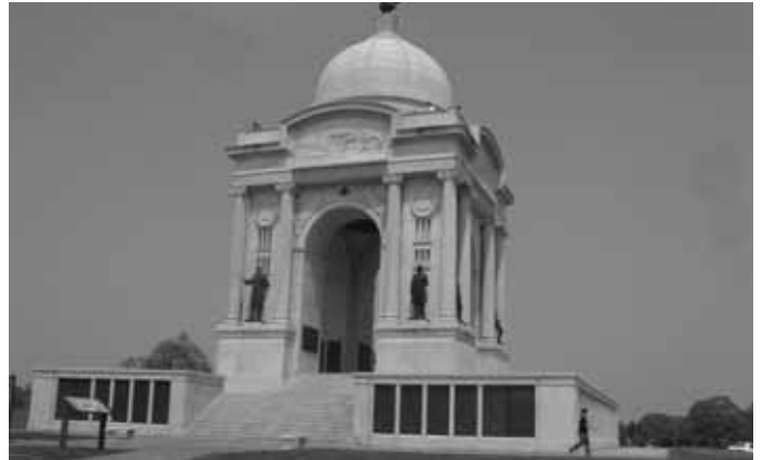
The Pennsylvania Memorial, on the battlefield at Gettysburg, features bronze tablets of all Pennsylvania units who fought there July 1-2-3, 1863

exactly time and distance, because I constantly found myself taking detours to this side of the road or that one, looking at various monuments and trying to imagine what it would have been like in 1863 from the Confederates line. I had picked up the battlefield map from the Welcome Center, and was able to follow my progress pretty well, as well identifying key points in the battlefield, such as the location of Pickett’s Charge and Longstreet’s Headquarters on Warfield Ridge.