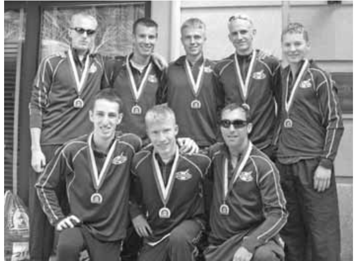
Familiar faces at the Winter Series, the AFA’s Marathon Team poses after a successful and satisfying performance at this year’s Boston Marathon.

While the Air Force Academy allows the cadets to compete in such high level events as the Boston